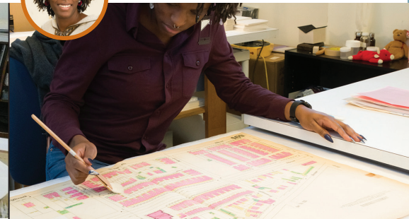
NEA Book Conservation Fellow (2022-23), graduate of Winterthur/University of Delaware, Program in Art Conservation (WUDPAC)