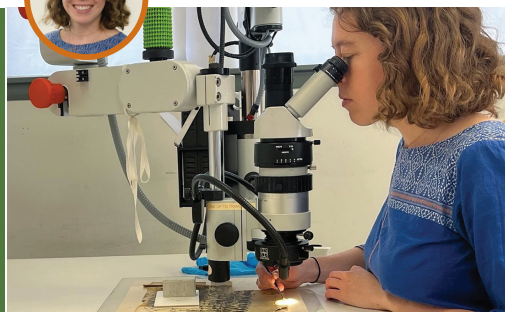
Photograph Conservation Intern, Institute of Fine Arts, New York