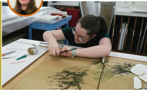
Mellon Paper Conservation Fellow (2023-24), graduate of Queen's University, Ontario, Canada