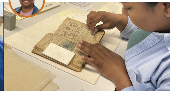
Book Conservation Intern, Winterthur/University of Delaware Program in Art Conservation (WUDPAC)